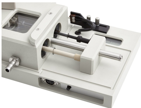
Asymmetric (ratio) mixing