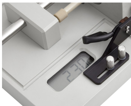
Digital temperature display