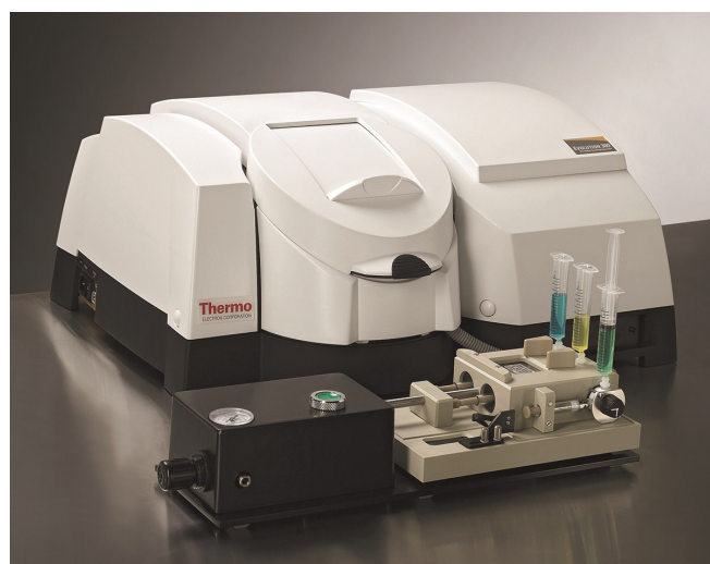
RX2000 and drive accessory interfaced with a Thermo Evolution 300 spectrometer

For more information about the RX2000 or other Applied Photophysics products visit our website at www.photophysics.com/products or email us at sales@photophysics.com