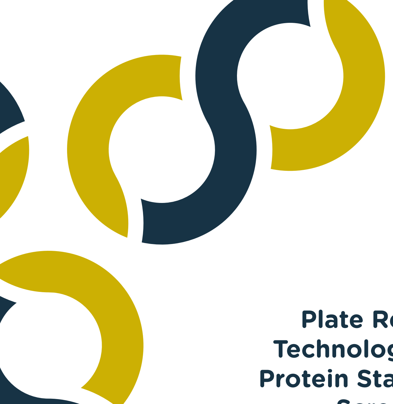
Plate Reader Technology for Protein Stability Screening

Applied Innovations in Protein Characterisation